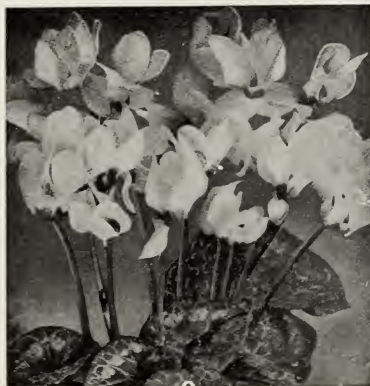
Giant Persian Cyclamen

L'Innocence —Pure white; large. This is the earliest of the whites.